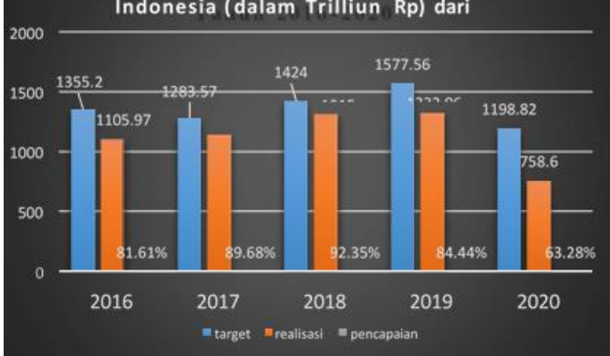
Figure 1. Realization of Tax Revenue

Figure 1 shows that tax revenue in Indonesia has never reached its target from year to year, even though it has increased nominally each year. If we look at the period from 2018 to 2020, the percentage of achievement has been decreasing: 92.35% in 2018, 84.44% in 2019, and a further decrease to 63.28% in 2020. Based on the 2021 State Budget report, in January 2021, the realization of tax revenue from the construction and real estate sectors contracted by 33.02% year on year (yoy). This figure is worse than the achievement in the same period last year, which was -15.7%. This phenomenon indicates factors affecting the decline in tax revenue over the past two years without improvement.